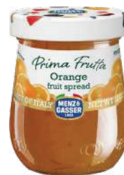
ORANGE PACKING: 12x340g