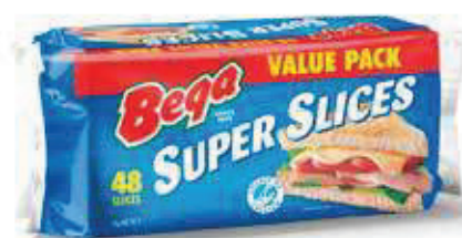
SUPER SLICES PACKING: 6 x 1kg