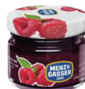
RASPBERRY PACKING: 48x28g