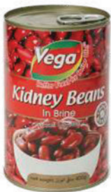
RED KIDNEY BEANS PACKING: 24x400g