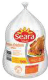
CHICKEN 900gm PACKING: 10x900g