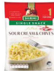
SOUR CREAM & CHIVES PACKING: 12 x 80g