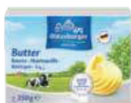
BUTTER 250g PACKING: 40 x 250g