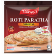
ROTI PARATHA ORIGINAL PACKING: 24X375G