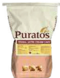
TEGRAL SATIN CREAM CAKE CHOCO PACKING: 12.5kg