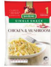
CHICKEN & MUSHROOM PACKING: 12 x 80g