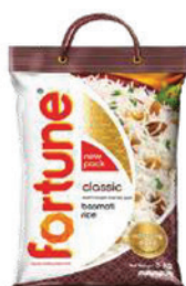
EVERYDAY BASMATI PACKING: 8x5KG 10x1KG