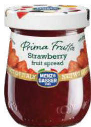
STRAWBERRY PACKING: 12x340g