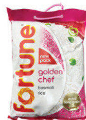
GOLDEN CHEF BASMATI PACKING: 4x5KG