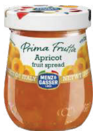
APRICOT PACKING: 12x340g