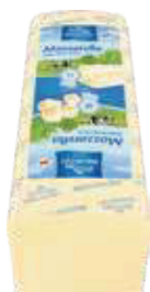
MOZZARELLA 3kg PACKING: 3kg block