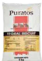
TEGRAL BISCUIT PACKING: 25kg