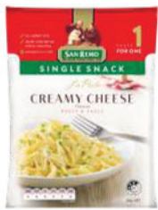
CREAMY CHEESE PACKING: 12 x 80g