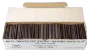
CHOCOLATE STICKS (BAKE STABLE) PACKING: 15x1.6kg