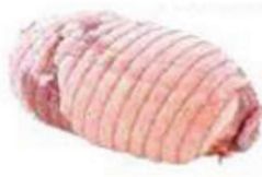
LAMB LEG B/LESS PACKING: 20kg approx.