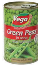
GREEN PEAS PACKING: 24x400g