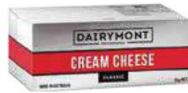
CREAM CHEESE PACKING: 6x2kg blocks