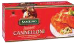
CANNELLONI PACKING: 12 x 250g