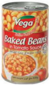
BAKED BEANS PACKING: 24x400g