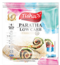
ROTI PARATHA LOW CARB PACKING: 20X390G