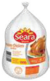
CHICKEN 800gm PACKING: 10x800g