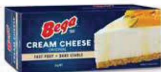
CREAM CHEESE PACKING: 6 X 2kg