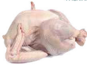
WHOLE TURKEY PACKING: 7-8kg/ pc