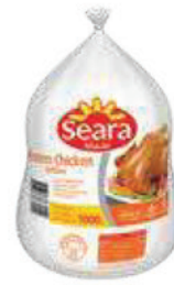
CHICKEN 1000gm PACKING: 10x1000g