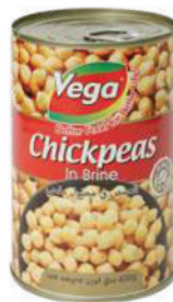
CHICKPEAS PACKING: 24x400g