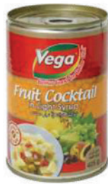
FRUIT COCKTAIL PACKING: 24x425g