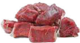
BEEF CHUNKS PACKING: 20x900g