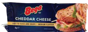
CHEDDAR BLOCK PACKING: 6 x 2kg