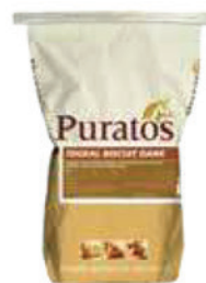
TEGRAL BISCUIT DARK PACKING: 25kg