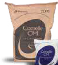
STRAWBERRY PACKING: 6x2.5kg