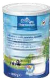
MILK POWDER 1.8 kg PACKING: 6 x 1.8kg