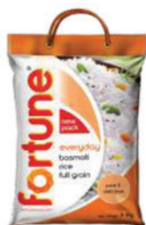
EVERYDAY BASMATI PACKING: 8x5KG 10x1KG