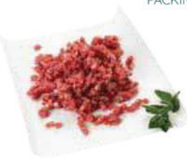
BEEF MINCED PACKING: 40X450g