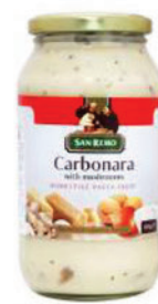
CARBONARA PACKING: 12 x 500g