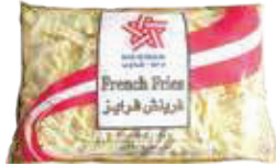
FRENCH FRIES CRINCLE CUT PACKING: 10x100g