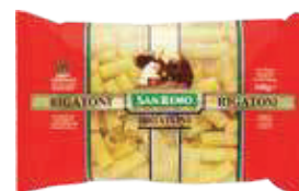
RIGATONI #22 PACKING: 12 x 500g