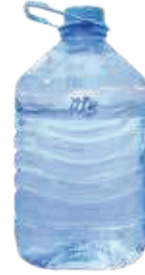
5 Ltr PACKING: 4x5Ltr