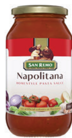
NAPOLITANA PACKING: 12 x 500g