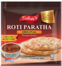
ROTI PARATHA WITH PENANG CURRY PACKING: 24X650G