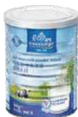
MILK POWDER 900g PACKING: 12 x 900g