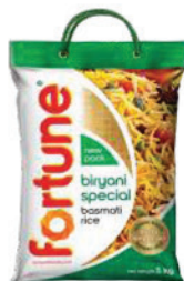
BIRYANI SPECIAL BASMATI PACKING: 4x5kg