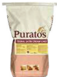
TEGRAL SATIN CREAM CAKE PACKING: 25kg