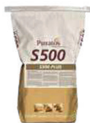
S500 A+ BREAD IMPROVER PACKING: 10kg