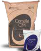
VANILLA PACKING: 6x2.5kg