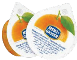
ORANGE PACKING: 200x14g