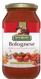
BOLOGNESE & MUSHROOM PACKING: 12 x 500g