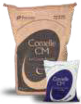
CHOCOLATE PACKING: 6x2.5kg