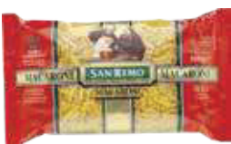
MACARONI #38 PACKING: 12 x 500g