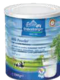
MILK POWDER 2.5 kg PACKING: 6 x 2.5kg