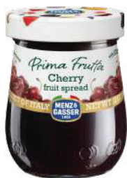
CHERRY PACKING: 12x340g