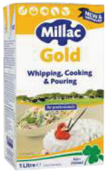
WHIPPING CREAM MILLAC GOLD (COOKING CREAM) PACKING: 12x1Ltr