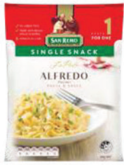
ALFREDO PACKING: 12 x 80g