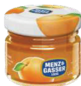
APRICOT PACKING: 48x28g