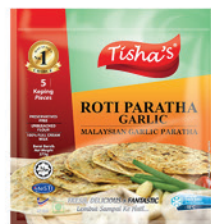
ROTI PARATHA GARLIC PACKING: 24X375G