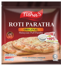
ROTI PARATHA ORIGINAL JUMBO PACKING: 8X1.5KG