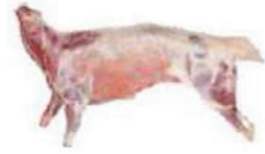
LAMB CARCASS WHOLE PACKING: 15kg approx.