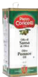
POMACE OLIVE OIL TIN PACKING: 4x5LTR