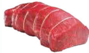
BEEF TENDERLOIN PACKING: 18kg