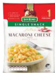
MACARONI CHEESE PACKING: 12 x 80g