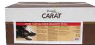
CARAT COVERLUX DARK (COMPOUND) PACKING: 10kg