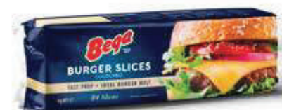
BURGER SLICES PACKING: 12 x 1kg