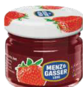
STRAWBERRY PACKING: 48x28g