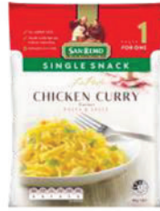
CHICKEN CURRY PACKING: 12 x 80g