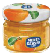
ORANGE PACKING: 48x28g