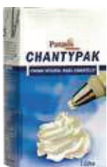
CHANTYPAK - NON DAIRY CREAM (WHIPPING CREAM) PACKING: 12x1Ltr