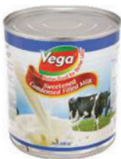
CONDENSED MILK PACKING: 24x390g