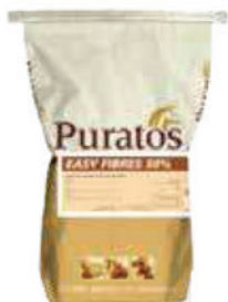
EASY FIBRES 50/50 PACKING: 20kg